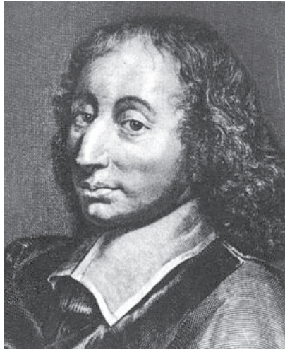
BLAISE PASCAL (1623-1662)