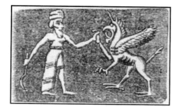
Fig. 11,2 Was Beowulf's method of mortally wounding Grendel entirely novel, or was he merely employeing a a tried and etested strategy? This illustration from an early Babylonian cylinder seal, and it portrays a man seizing and about to amputate the forelimb of a Grendel-like bipedal monster.

But is Beowulf's method of slaying Grendel unknown elsewhere in the historical record? Are there no depictions to be found of similar creatures being killed in a similar way? It would seem that there are, the illustration below being one example (see Figure 11.2). It is taken from an impression of an early Babylonian cylinder seal now in the British Museum, and clearly shows a man about to amputate the forelimb of a bipedal monster whose appearance, though stylistic, fits the descriptions of Grendel very closely. I know of no scholar who would venture to suggest that the Old English author of Beowulf filched his idea from his knowledge of Babylonian cylinder seals. So we may, I think, safely assume that Beowulf's method of slaying this particular kind of animal was not entirely unknown in the ancient world. Nor, indeed, was the Grendel itself entirely unknown in the ancient world, as is evident from the following item depicted in Figure 11.3.